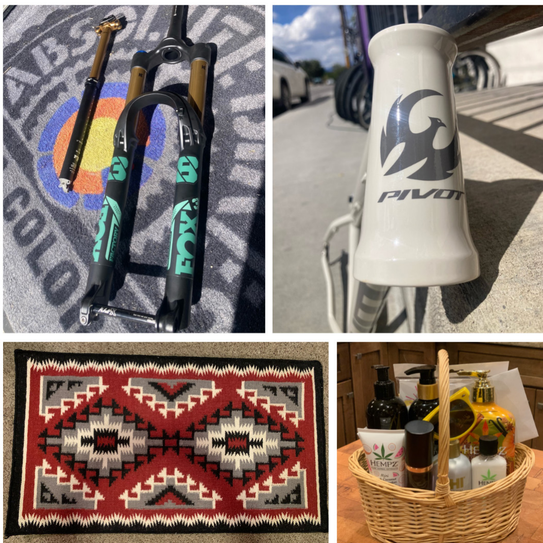
A SMALL SAMPLING OF AUCTION ITEMS AT THE 2022 MEMBER PARTY

In-kind donations are eligible for the same sponsor recognition as shown on page 2. Want to donate a mix of cash and in-kind? That works too.