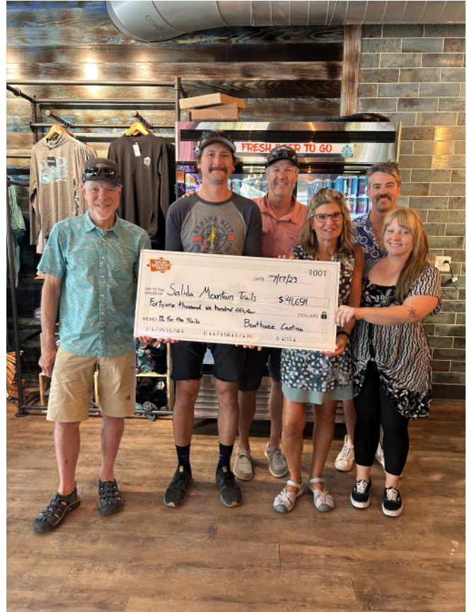
BIG CHECK PHOTO