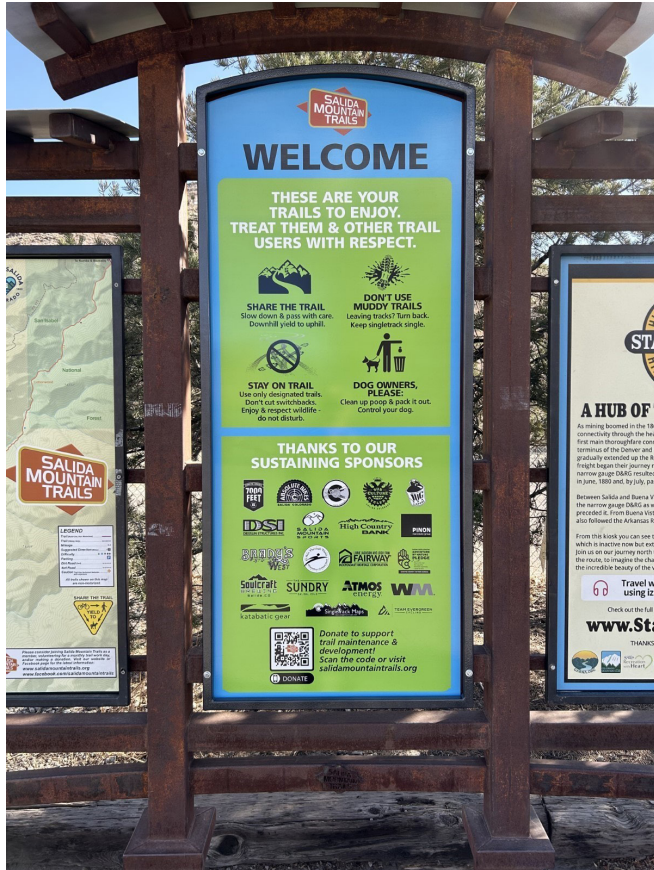
YOUR LOGO HERE